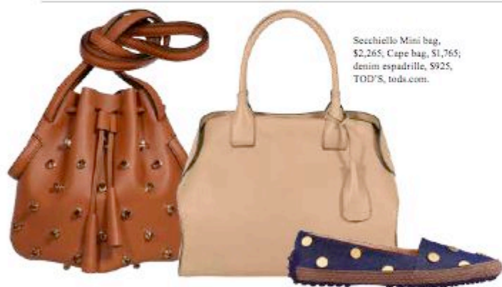
Secchiello Mini bag, $2,265; Cape bag, $1,765; denim espadrille, $925, TOD'S, tod's.com

More heart surgeries take place at the Texas Medical Center than anywhere else in the world. The hospital group even performed the first successful heart transplant in the country in 1968.