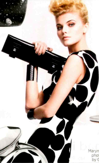
Maryna Linchuk